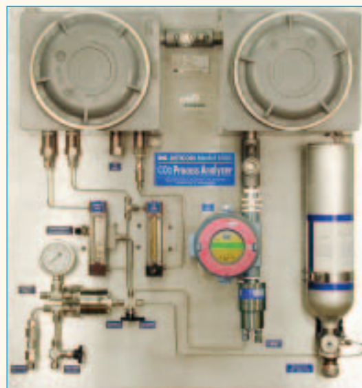
(0-20% Range Pictured Above)

Detcon Model 1000-CO2 process analyzers provide continuous, real-time measurement of CO2 concentrations in natural gas pipelines, gas treating plants, SRU overhead gas lines, as well as other applications. Available ranges are from 0-3,000 ppm up to 0-50%. The system can be provided with optional on-board manual calibration. This design employs Detcon's sub-miniature NDIR optical sensor element with a five-year conditional warranty. The analyzer features a microprocessor-based signal-conditioning transmitter with local digital display, fault supervision, calibration mode indicator, alarm relays and an RS-485 serial port. The instrument package is rated for use in electrically classified areas: Class I; Division 1; Groups C, and D. Line power, battery and solar powered models are available.